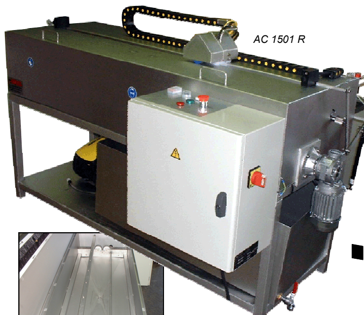
AC 1501 R