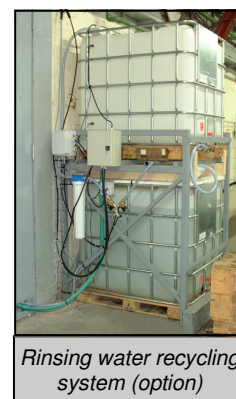
Rinsing water recycling system (option)